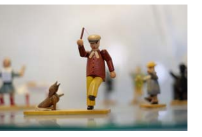
Shallow depth of field for a beautiful "bokeh" effect Deep focus to capture even distant background in vivid detail